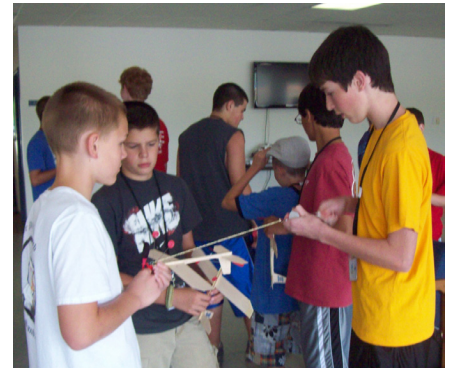
Stop winding just before the rubber band breaks...