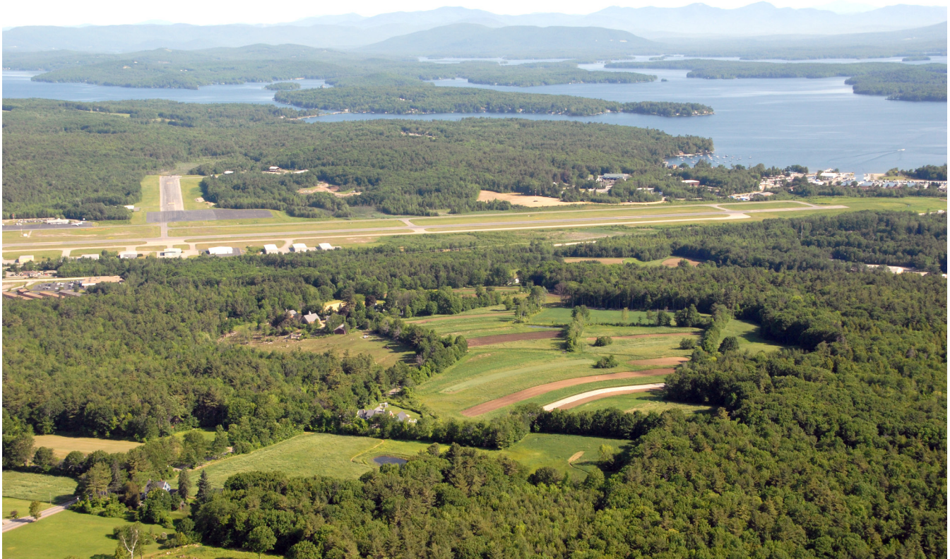
View of Laconia Airport from the south. Lake Winnepesaukee is at the top of the photo. The runway is visible in the center and farm fields in the foreground.

Realizing that the growing city needed a better airfield, a Citizens Committee, with support from the Civil Aeronautics Administration, met with the Laconia City Council and Mayor to discuss enlarging the airport. With space limited at the current site, the City and the County jointly decided to purchase parcels of land in nearby