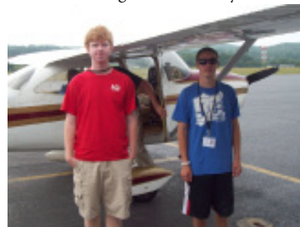
Two 2011 alumni back for more in 2012