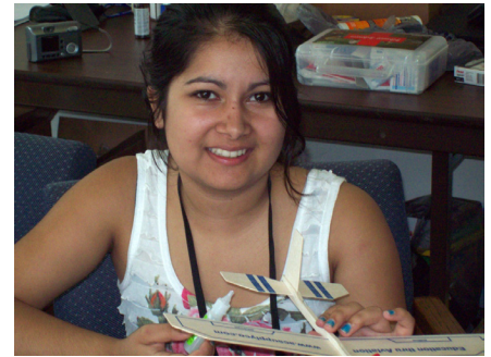
This plane will fly better than all the others...it's mine!

The Experimental Aircraft Association, Laconia Chapter #1516 has been active with their “Young Eagles” program. Through EAA and Young Eagles, 45 students have flown in the last year and a half. In addition, the chapter has signed up to do the newly introduced “Eagle” program. It is similar to the Young Eagles but for