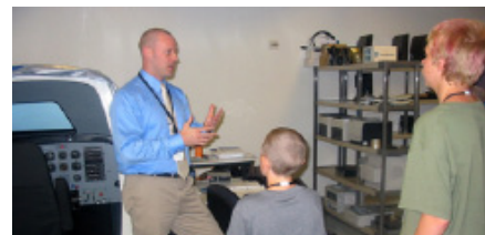
Flying the simulator at PlaneSense Fractional Ownership Program