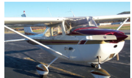
Cessna 172G to be raffled on 1/5/12