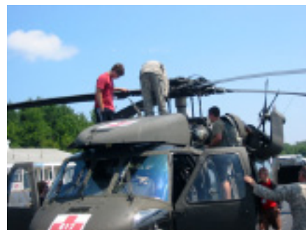
NH National Guard Blackhawk visit during ACE Academy